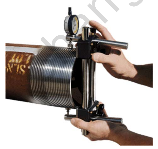
MRP Crest Diameter and Ovality Gage Inspecting a Part

Per 6.1.1, "a manufacturer who produces products using the threads covered by this Specification shall have access to setting standards for thread diameter gauges[...] for each size and type of thread produced." Traditional standards need replacing.