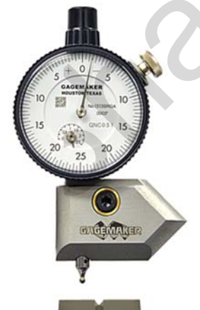
TA-3002 Thread Addendum Gage Inspecting a Part

Inspection should be done with an indicator style gage with contact points, like our TA-3002 Thread Addendum Gage. Choose a contact point based on the Threads Per Inch (TPI). In Table 20, 5B provides the options for you: