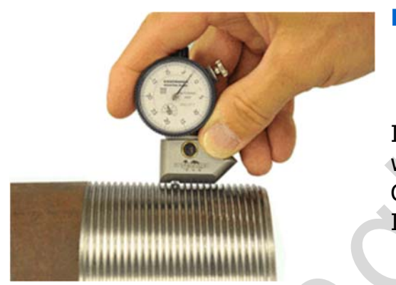
How do I inspect it?

All casing threads need to be inspected. Non-upset tubing (NUE), regular thread external-upset tubing (EUE), and integral joint tubing must all be inspected. For casing and tubing, the inspection tolerance is \pm 0.0015 in for both the coupling and pin.