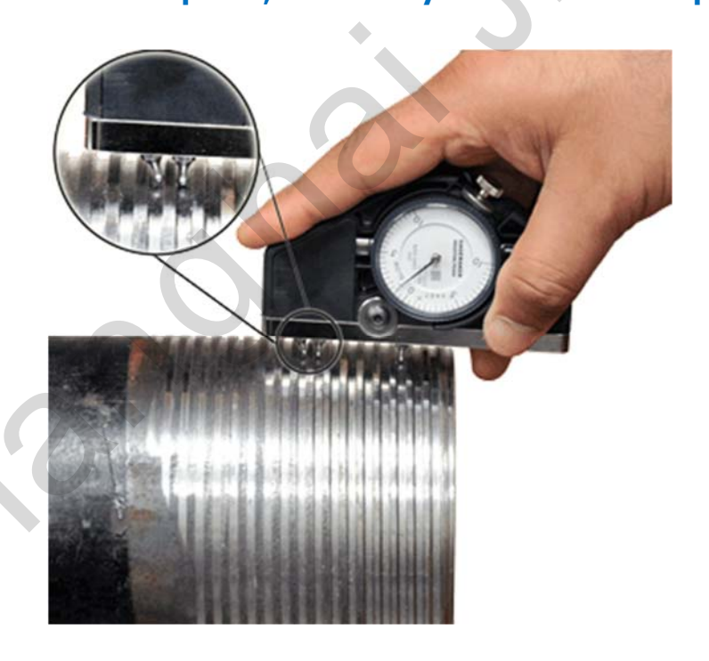
TW-6001 Thread Groove Width Gage Inspecting a Part

Tooth thickness is now a required, mandatory element to be inspected.